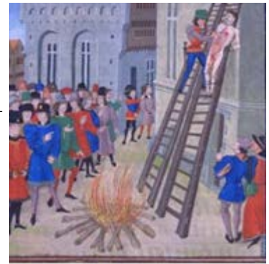
Image of the torture of Hugh Despenser lover of Edward II. 1st to be disemboweled then burned.

We will also sift through highlights of the data collected by modern day government and activists groups (such as the National Gay and Lesbian Task Force and the Anti-Violence Project) documenting violence against homosexuals, and come to a current understanding about the epidemiology of violence motivated by one's sexual orientation.